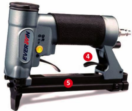
AUTO SERIES Auto Fire, Short Magazine