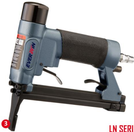
LN SERIES Single Fire, Long Nose