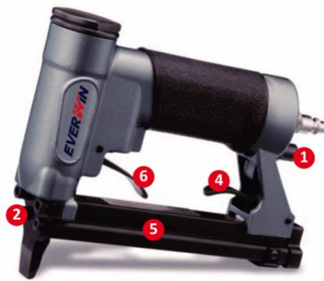
US SERIES Single Fire, Short Nose