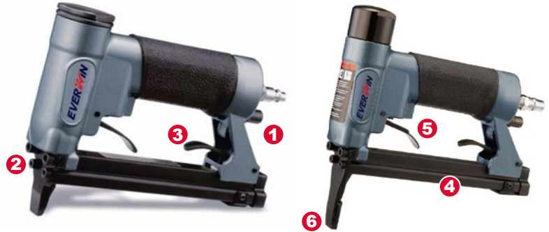
US serie Single fire, short nose