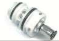
RCVA1 Straight Fitting Type